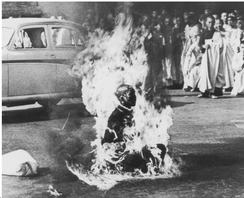
Vietnamese monk's protest by self-immolation before the War. 6

Images of the Vietnam War were also decisive in shaping public debate.