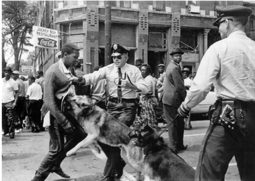
Student attacked by police dogs during 1963 Birmingham protests. 2

Images of civil rights protestors being attacked with fire hoses and police dogs captured the nation’s attention and galvanized public support for the civil rights movement in the 1960s. Graphic images conveyed to a national audience the violent reality of segregation and led to widespread calls for action. 3 Images of protests and the response of local officials “struck like lightning in the American mind . . . searing the conscience of the nation.” 4 Their impact is considered one of