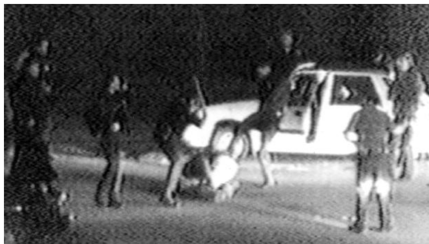
Rodney King's beating in Los Angeles. 13

More recently, video recordings have informed and inspired public debate over policing and race, confirming the importance of recording to public debate.